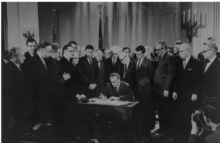
President Johnson signs the Fair Housing Act on April 11, 1968

President Lyndon B. Johnson signed the Fair Housing Act (Title VIII of the Civil Rights Act of 1968) into law on April 11, 1968, exactly one week after the assassination of Dr. Martin Luther King, Jr. 4 The Fair Housing Act of 1968 prohibits discrimination concerning the sale, rental, advertising, and financing of housing on the bases of race, color, religion, and national origin. 5 In 1974, sex (or gender) was added as a protected class to the Fair Housing Act. In 1988, the Fair Housing Act