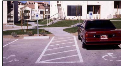
Example of accessible route from parking area