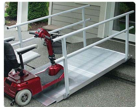
Example of a reasonable modification

A “reasonable modification” is a structural change made to existing premises, occupied or to be occupied by a person with a disability, in order to afford such person full enjoyment of the premises. Reasonable modifications can include structural changes to interiors and exteriors of dwellings and to common and public use areas. A request for a reasonable modification may be made at any time during the tenancy. The FHAct makes it unlawful for a housing provider or homeowners’ association to refuse to allow a reasonable modification to the premises when such a modification may be necessary to afford persons with disabilities full enjoyment of the premises.